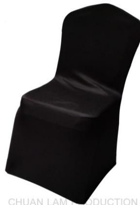
BC02 Cushion Chair with Cover