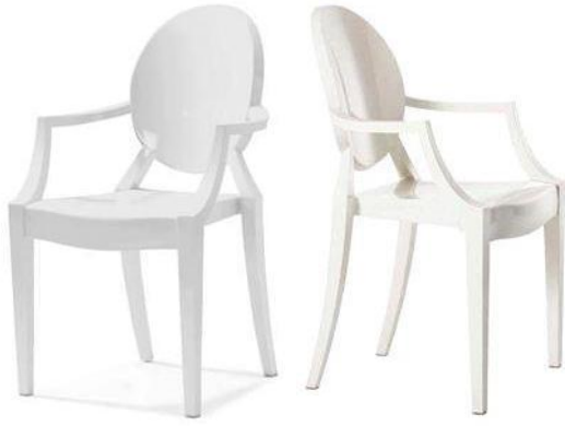
BC05 White Arcylic Ghost Chair