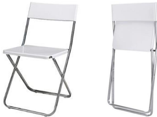
BC07 Folding Chair

ITEM CODE: BC00 Armless Bistro Chair SALE PRICE: DISPLAY SET ONLY @ $190 EACH DIMENSION: 750H * 420D * 380W mm SEATING HT: MATERIAL: Wicker Seats with Aluminium Frame REMARKS: Outdoor Furniture INVENTORY: 18 black