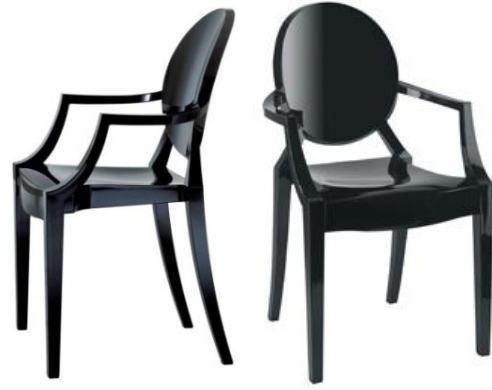
BC06 Black Arcylic Ghost Chair