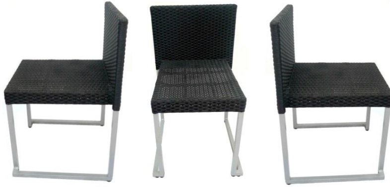
BC00 Armless Bistro Chair

ITEM CODE: BC00 Armless Bistro Chair SALE PRICE: DISPLAY SET ONLY @ $190 EACH DIMENSION: 750H * 420D * 380W mm SEATING HT: MATERIAL: Wicker Seats with Aluminium Frame REMARKS: Outdoor Furniture INVENTORY: 18 black