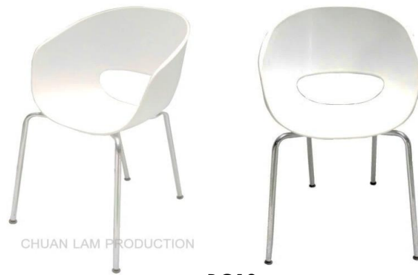
BC10 Stacking Curve Chair

ITEM CODE: BC10 Stacking Curve Chair SALE PRICE: NOT FOR SALE DIMENSION: 770/450H * 450D * 580W mm SEATING HT: MATERIAL: Plastic, stainless steel legs REMARKS: Indoor / Outdoor Furniture INVENTORY: 11 matte white