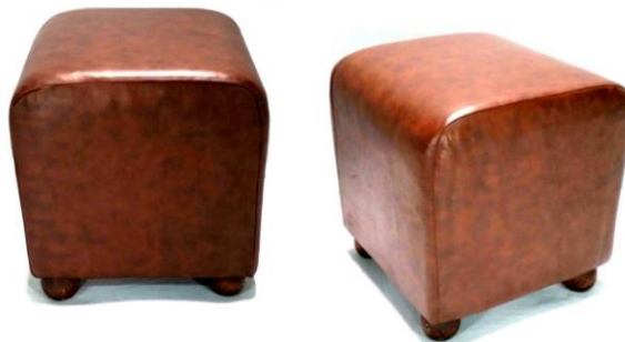
S06 Brown Leather Stool