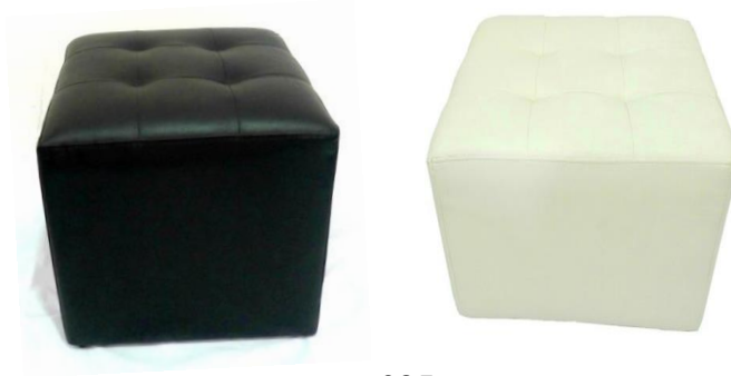
S05 Leather Ottoman