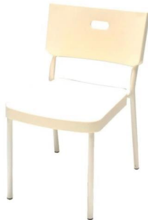
BC08 Stacking Chair