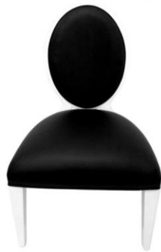
SS06 English cushion chair