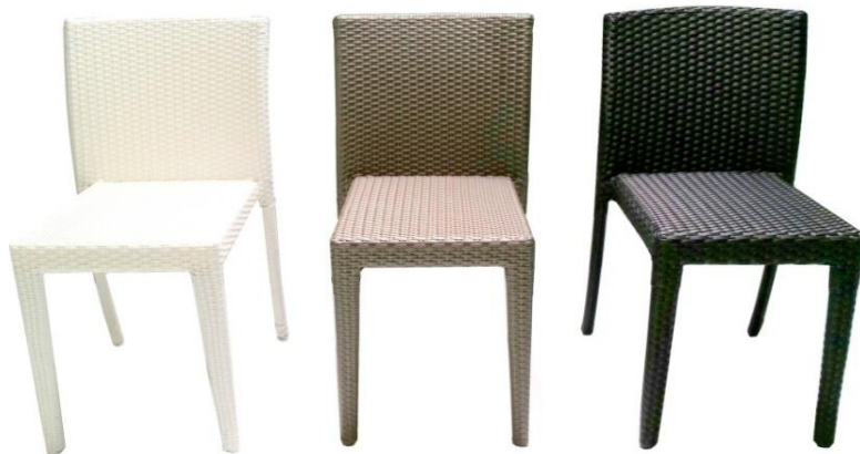
PT168 Outdoor Wicker Chair

ITEM CODE: BC10 Stacking Curve Chair SALE PRICE: NOT FOR SALE DIMENSION: 770/450H * 450D * 580W mm SEATING HT: MATERIAL: Plastic, stainless steel legs REMARKS: Indoor / Outdoor Furniture INVENTORY: 11 matte white