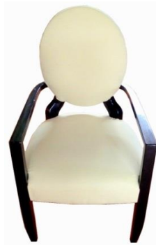
SS05 Beige English Cushion Chair