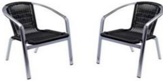
BC01 Armless Bistro Chair