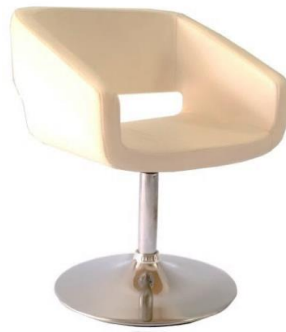
SC04 Swivel Chair