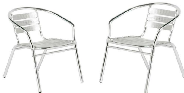
BC11 Aluminium Bistro Chair