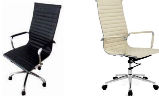
E03 Eames Executive Chair