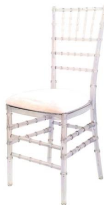
BC04 Clear Tiffany Chair w/ White Cushion