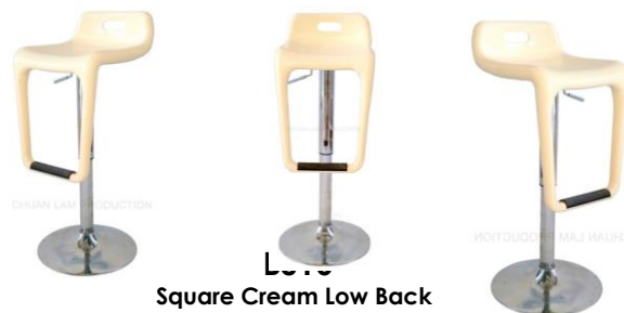
BS16 Square Cream Low Back Bar Stools