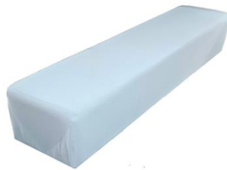
CSW12-1 White Long Ottoman

ITEM CODE: CSB12-1 Long Black Ottoman SALE PRICE: DISPLAY SET ONLY @ $300 EACH DIMENSION: 420H * 390W * 1820L mm SEATING HT: 420mm MATERIAL: PVC Leather seating REMARKS: Indoor Furniture INVENTORY: 26 black