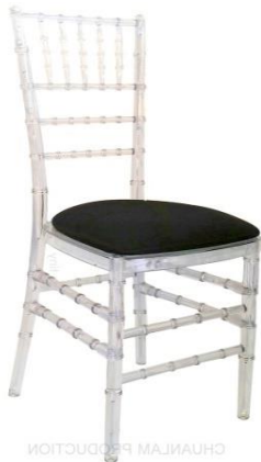
BC03 Clear Tiffany Chair w/ Black Cushion